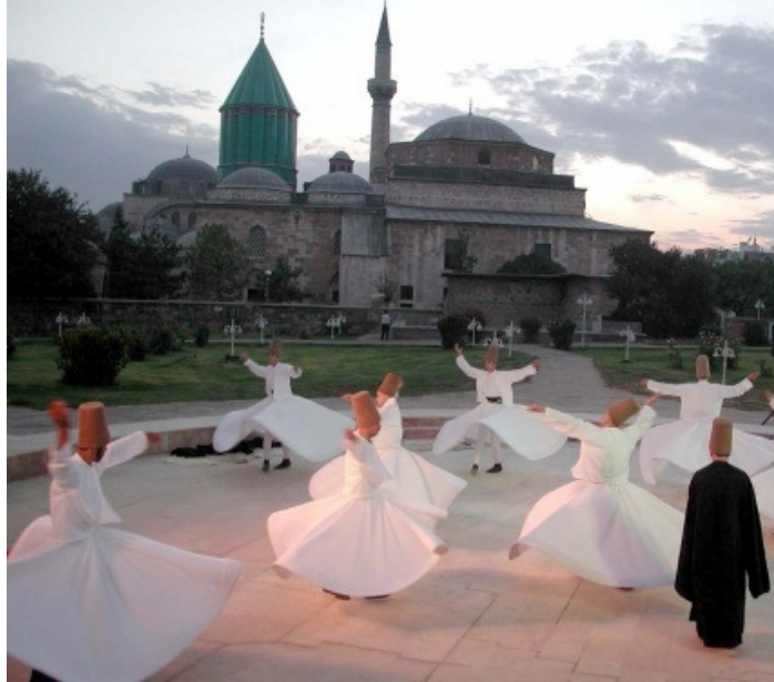
Sema outside Rumi's tomb